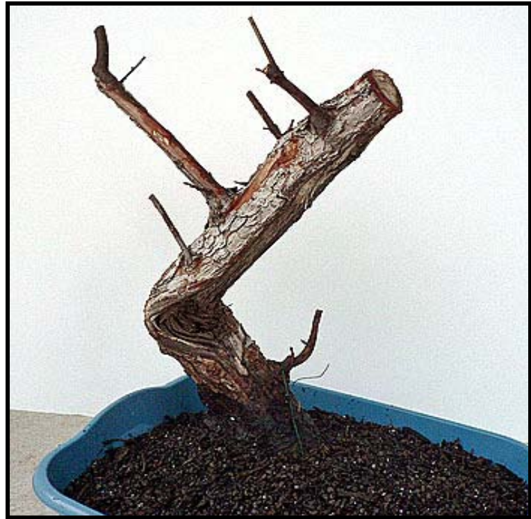
CEDAR ELM, CASCADE OR MOYOGI?