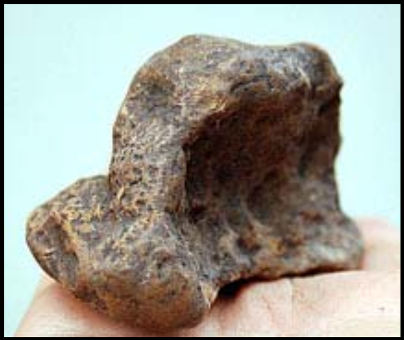
UNIQUE EXAMPLES OF SOME OF THE STONES COLLECTED. ABOVE, A MADONNA IMAGE?