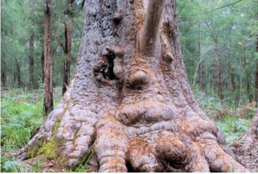
Looks like something out of Lord of the rings

Maybe not the "TALLEST" in the world but non the less impressive