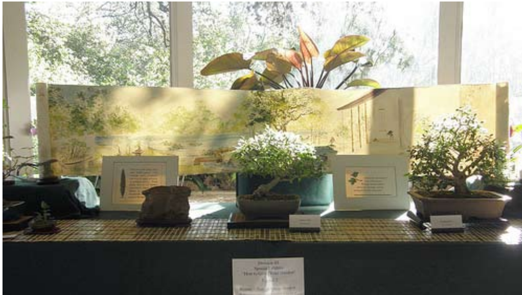
Part of the bonsai educational exhibit at Zilker Garden Festival