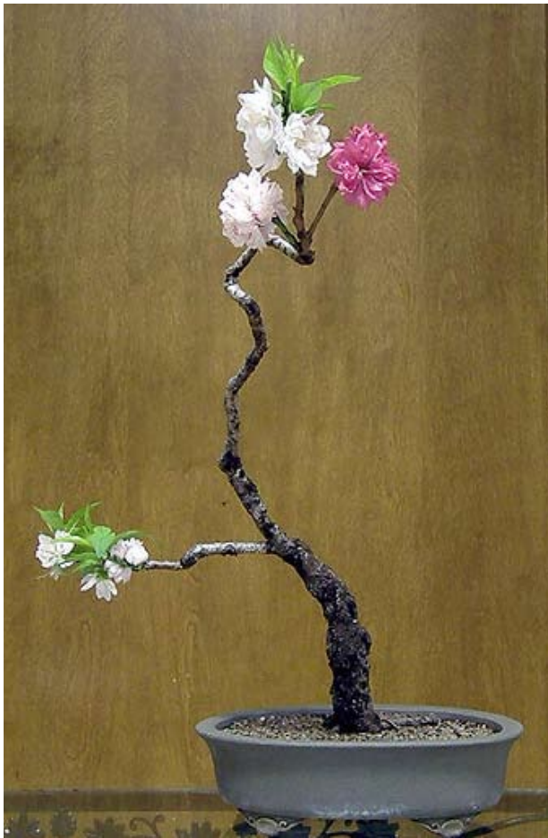
A peach bonsai on display at March's general meeting

Kakejiku is the Japanese name for the scroll that hangs in the tokanoma or the tearoom. It was introduced to Japan during the Heian period, primarily for displaying Buddhist images for religious veneration, or as a vehicle to display calligraphy or poetry. Later it became fashionable to portray birds and flowers as well as haiku. The kakejiku is an integral part of a formal bonsai display.