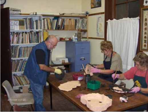
All hard at work

Please if you have any ideas on different types of meeting nights lets share them around – have you ever tried a blindfolded demonstration??