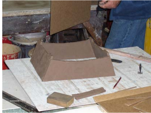
A masterpiece takes shape